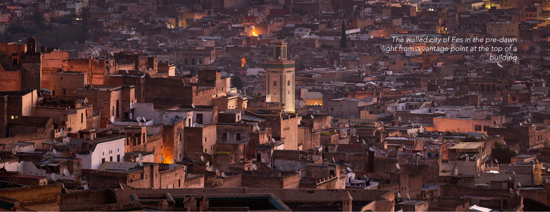
The walled city of Fes in the pre-dawn light from a vantage point at the top of a building