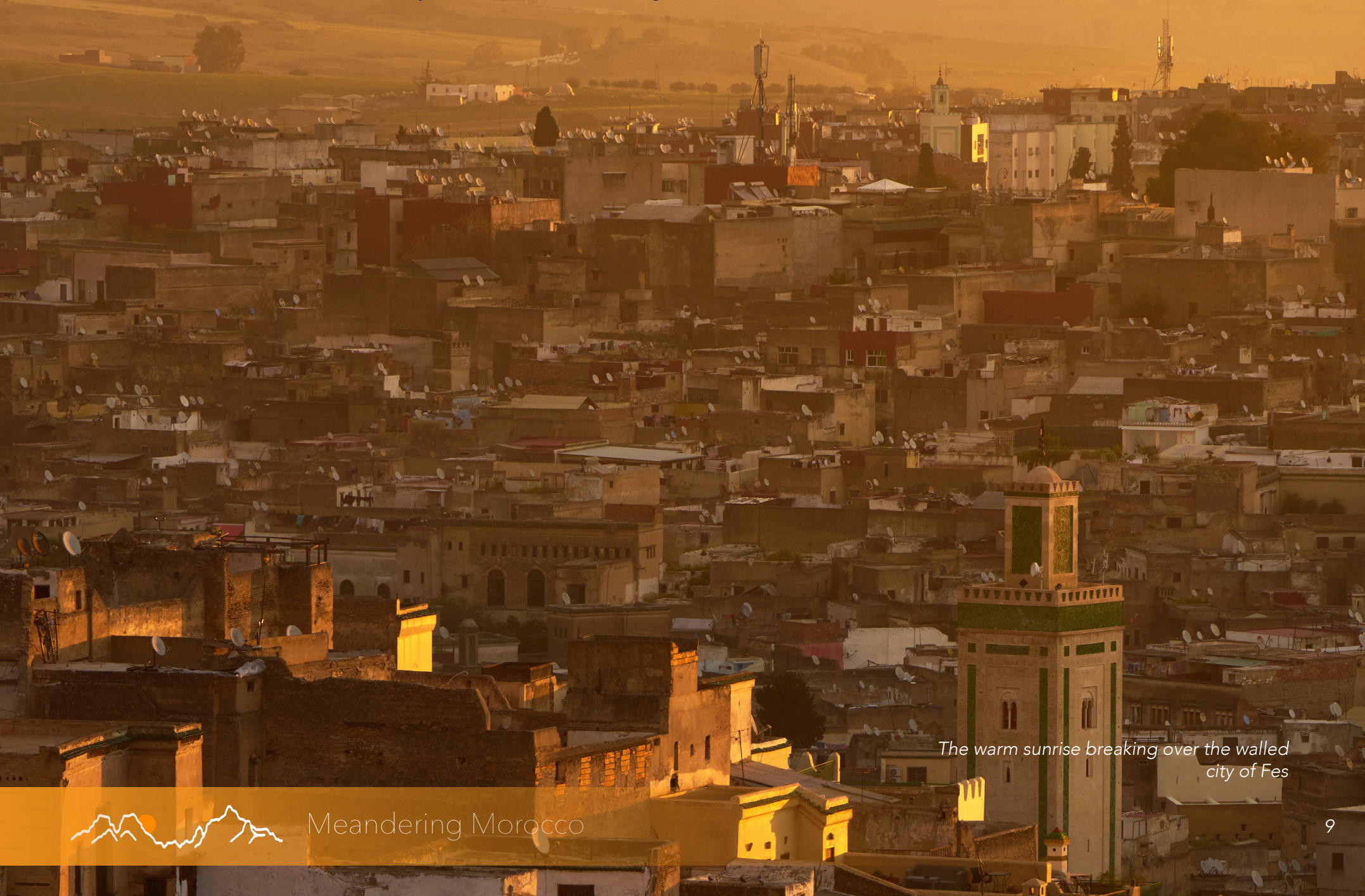
The warm sunrise breaking over the walled city of Fes

the trip is heavily geared towards photography, the travel experience itself will also be phenomenal.